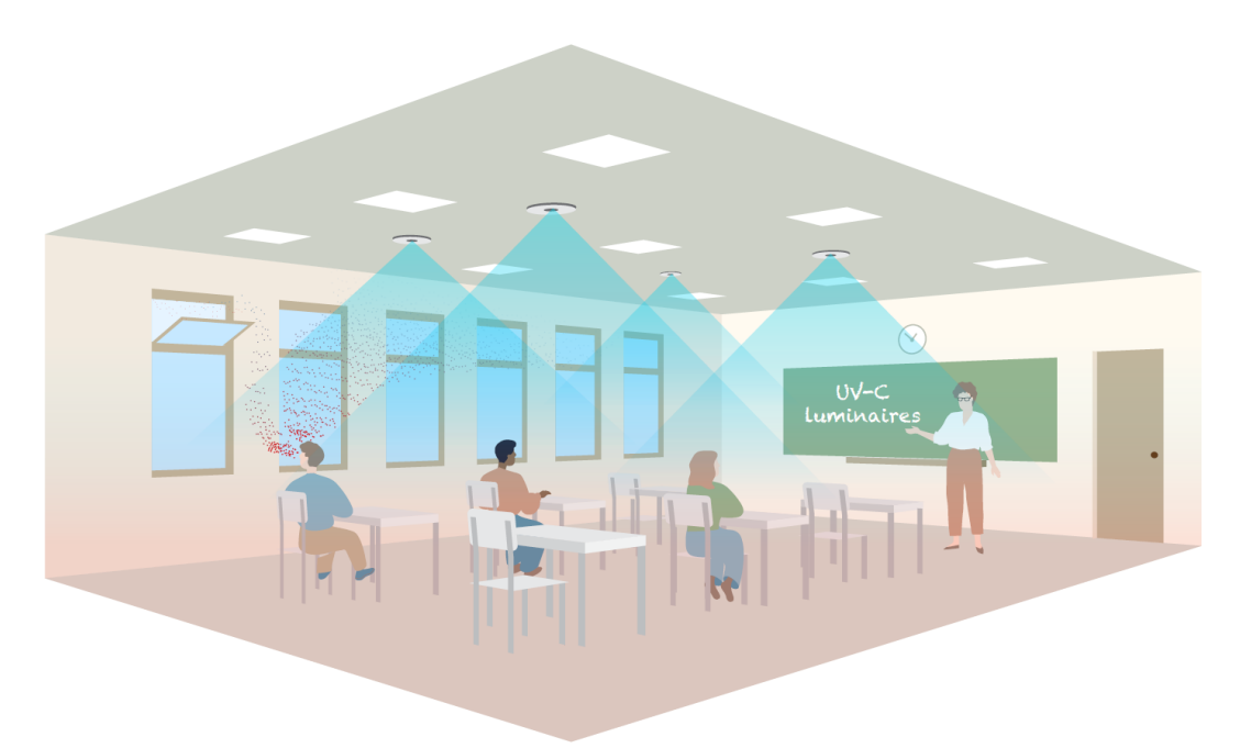
Figure 3: Illustrative example of a UVGI luminaire application