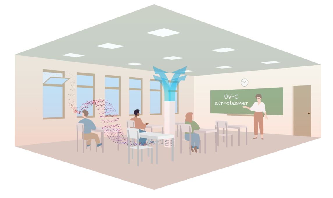
Figure 2: Illustrative example of UVGI air cleaner application